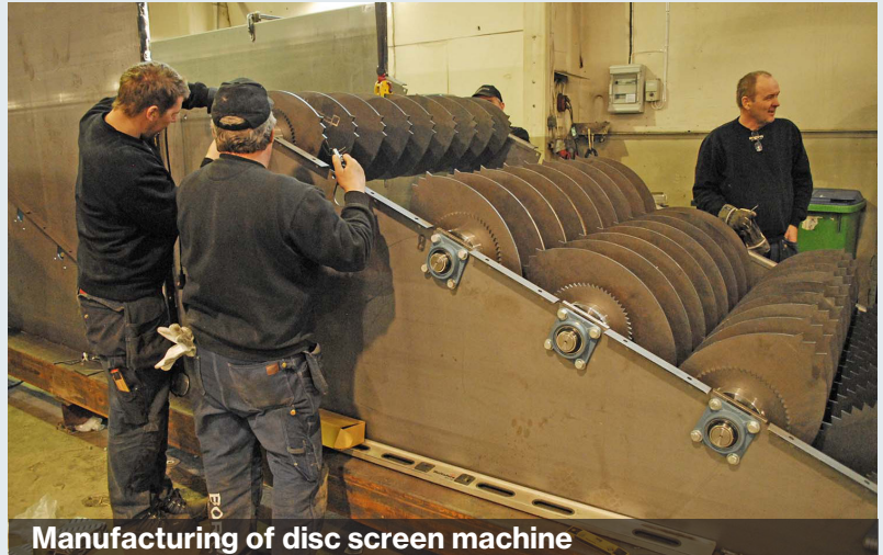
Manufacturing of disc screen machine