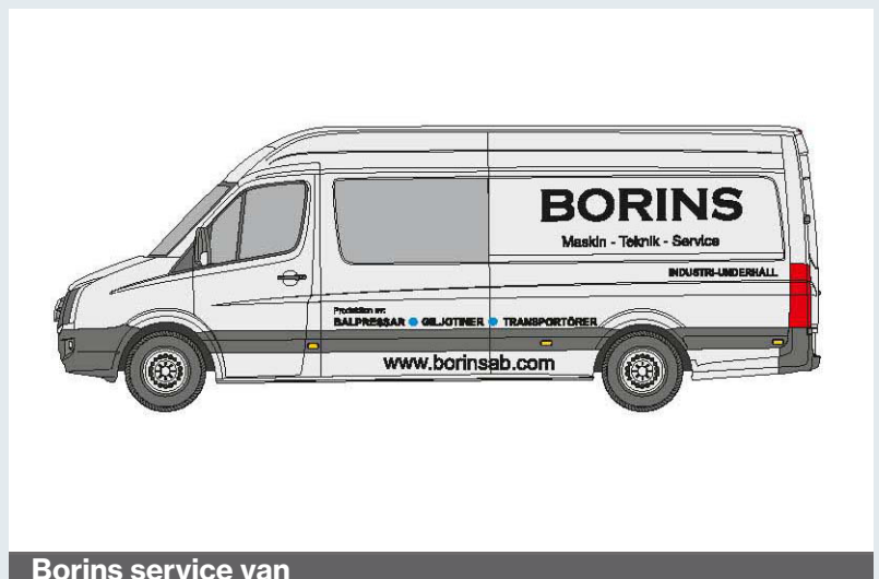
Borins service van