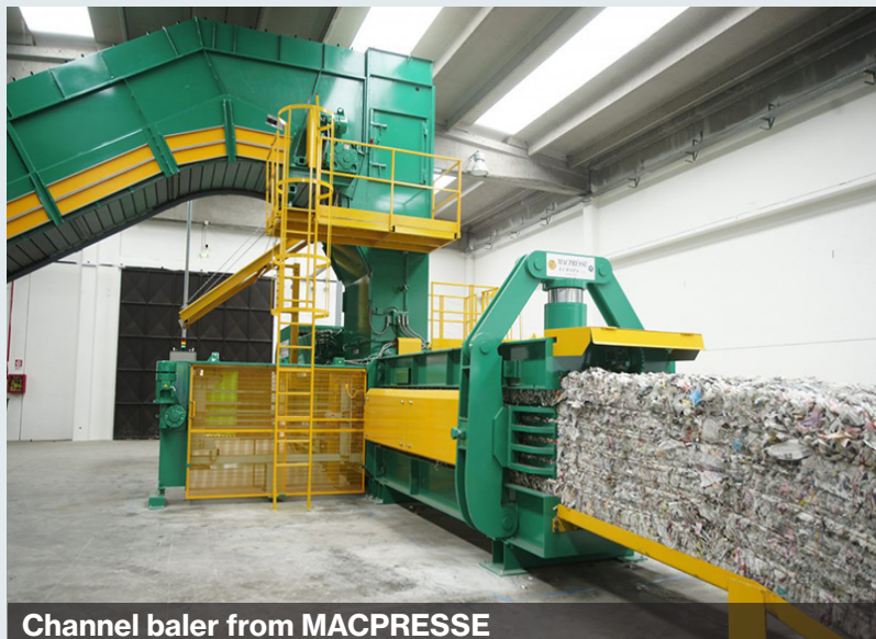
Channel baler from MACPRESSE