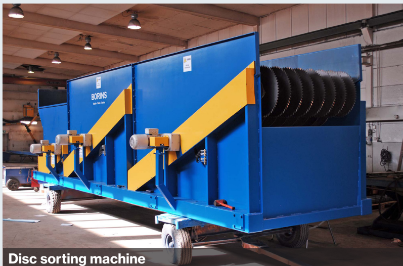
Disc sorting machine