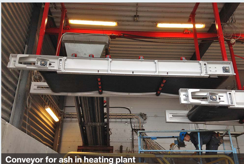
Conveyor for ash in heating plant