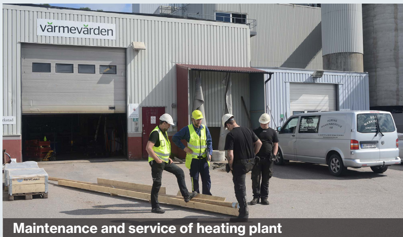
Maintenance and service of heating plant