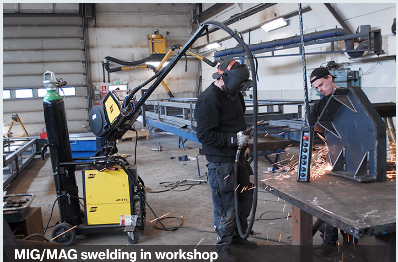
MIG/MAG welding in workshop