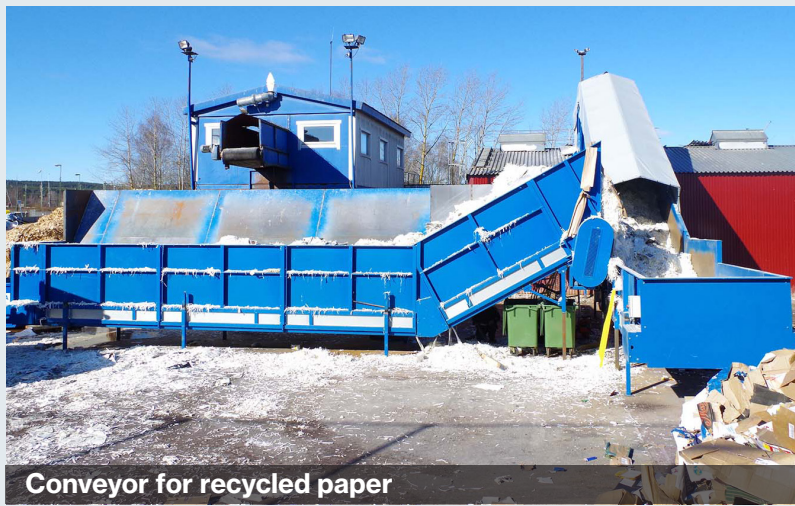
Conveyor for recycled paper