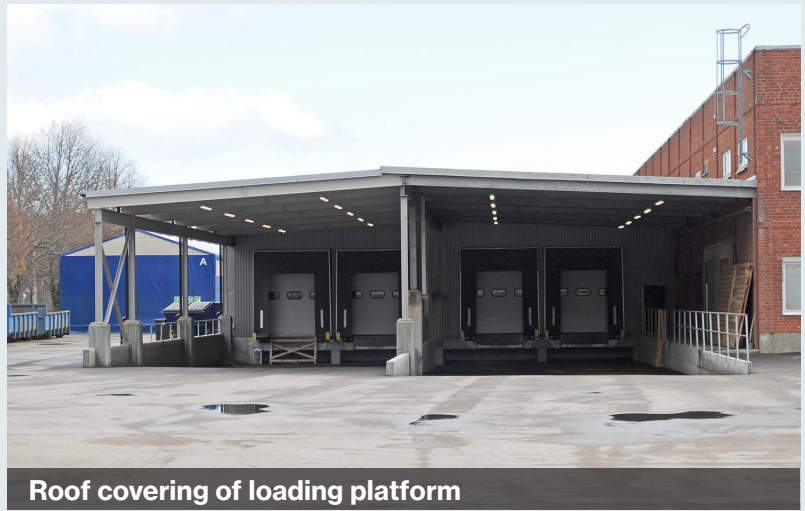
Roof covering of loading platform